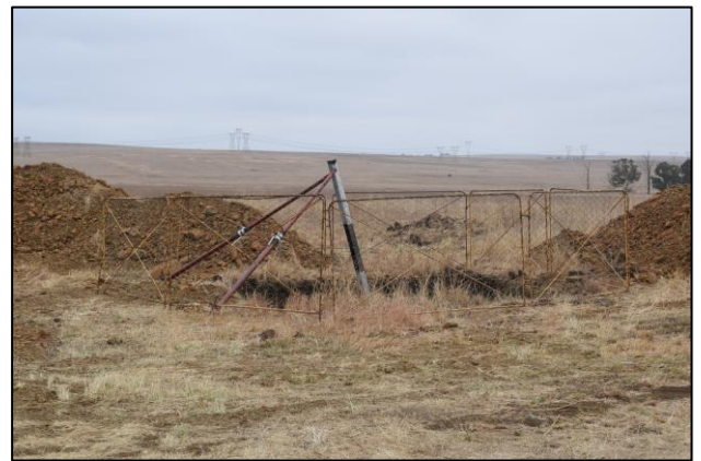
Figure 5: Fenced around trenches