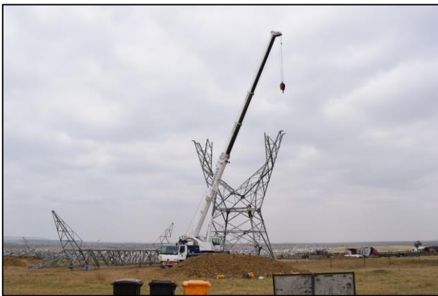
Figure 4: Tower Erecting