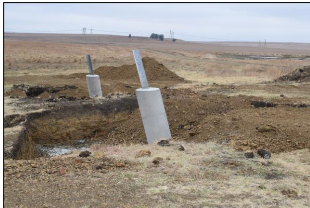
Figure 6: Backfilling