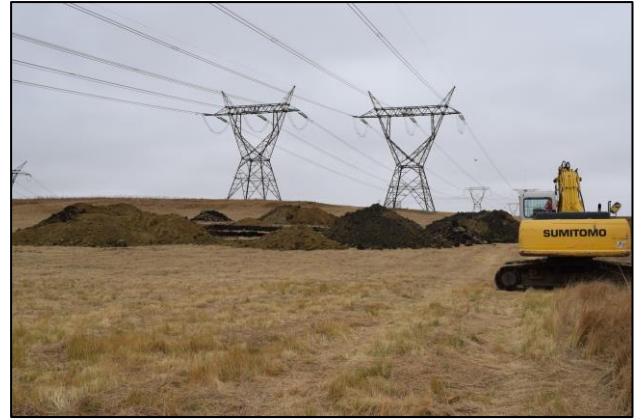
Figure 3: Excavating activities