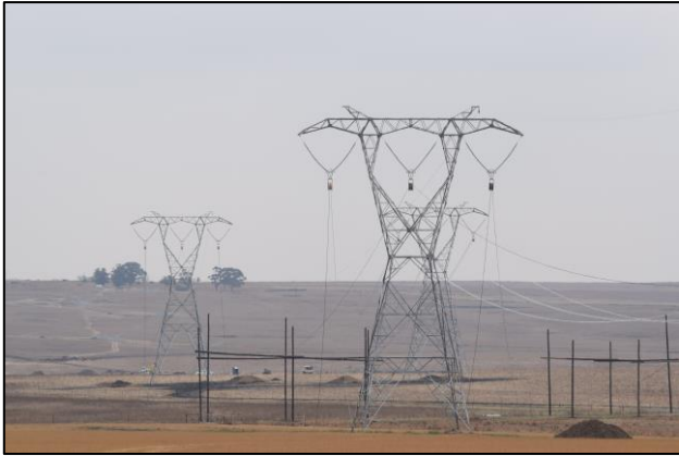
Figure 2: Stringing activities