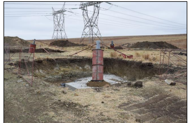
Figure 7: Shattering completed on V-blocks